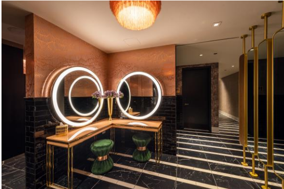
SX Sky Bar's lounge and women's bathroom

When not eating and drinking in the whimsical, vibrant lounge areas, SX Sky Bar guests can descend a grand staircase to a dance floor featuring light projection mapping. Tech-forward elements also appear in the form of a rotating hologram above the space's northern bar.