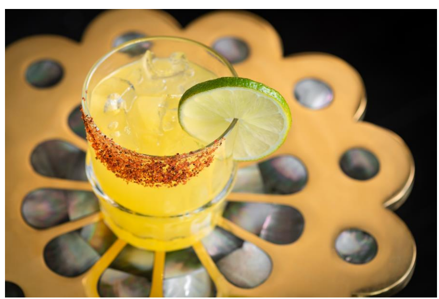
The Big Heat

SX Sky Bar's imbibing guests can choose from a variety of craft cocktails, beer, wine, and spirits. Guests can expect tasteful twists on classic drinks – like the SX Old Fashioned made with rich demerara syrup – as well as signature drinks, such as The Big Heat comprised of Casamigos Blanco tequila, passion fruit purée, lime, and firewater bitters; or the Agent Provocateur made with Remy Martin VSOP, pear liqueur, peach, and lime.