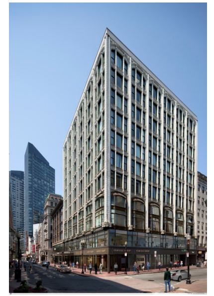
Exterior rendering of The Godfrey Hotel Boston

What's Old is New: The Design & Architecture of the New Godfrey Hotel Boston The expansion of the Godfrey brand honors the past while embracing the present and future