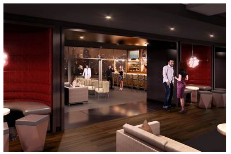
I|O Indoor Lounge Space