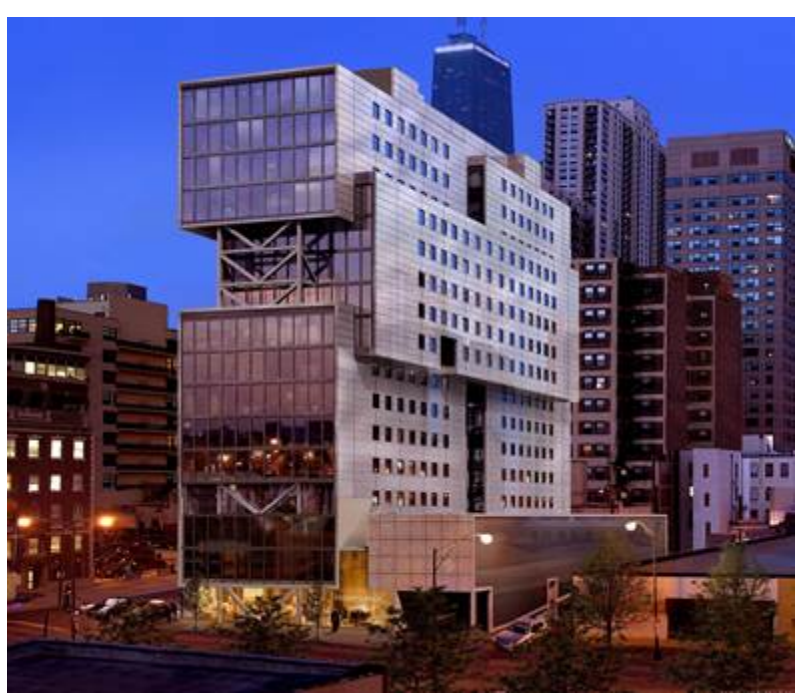
Exterior Rendering of The Godfrey Hotel

The modern, cubist-influenced hotel makes its mark on Chicago's rich architectural history in February