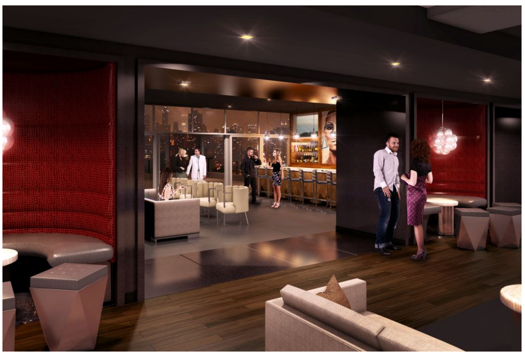
I|O Indoor Lounge Space