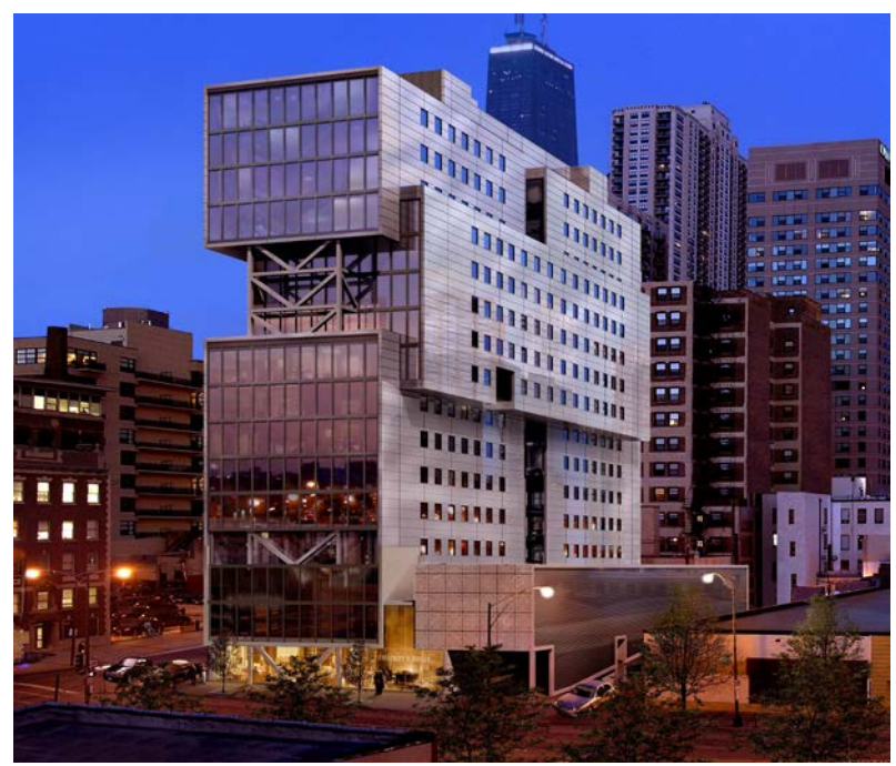
Exterior Rendering of The Godfrey Hotel

The 16-story lifestyle hotel reveals details for its upcoming River North opening